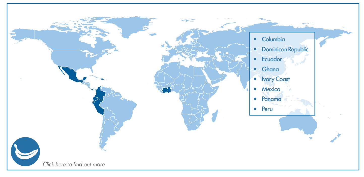
Figure 4: Our transparency map, published in 2019, identifies the sourcing countries of all Fairtrade bananas sold in our GB stores in 2018