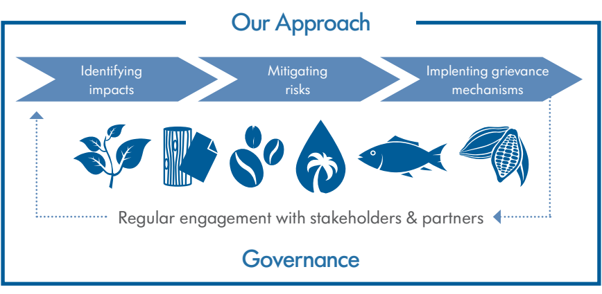
Figure 2: Our approach to human rights due diligence as outlined in our policy